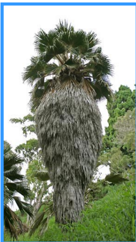
Lulu Palm D.T. Fleming Arboretum