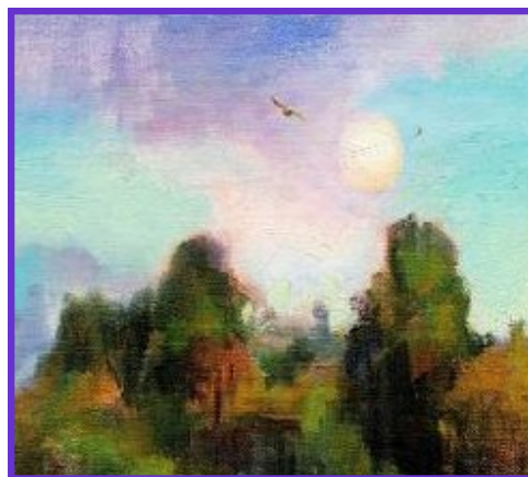
"Moon Dance", Pu'u Mahoe

For more information about the D.T. Fleming Arboretum visit www. flemingarboretum.org