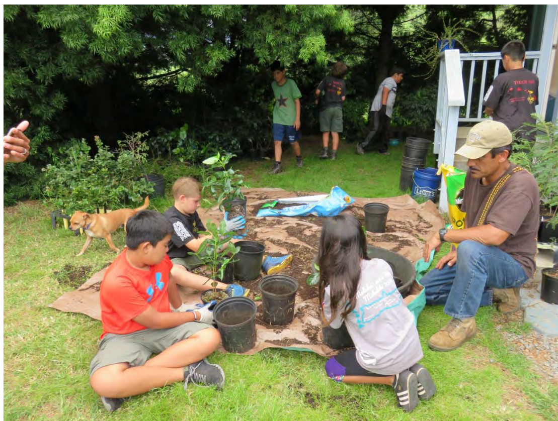
Extra volunteers help transplanting in nursery, Ohia from dibble tubes to 1 gallon pots, learning that Ohia have especially sensitive roots that must not be disturbed during transplanting.