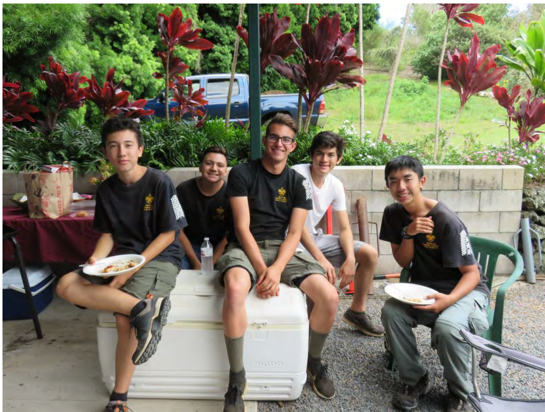
Lunch at noon as scheduled.