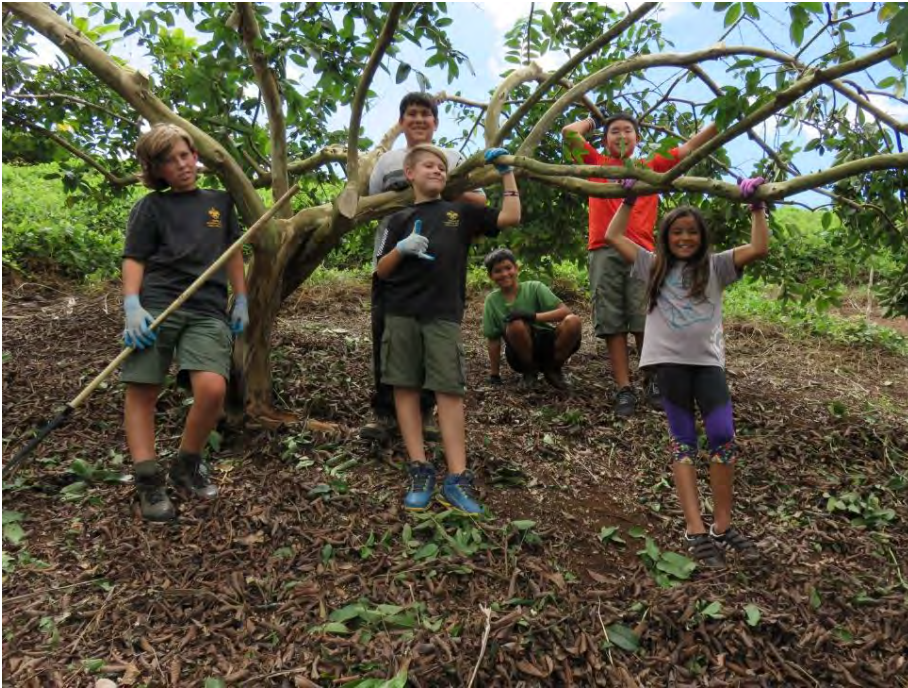
Cubs keep busy cleaning prunings from trails, while stakes are being installed, before helping with labels.