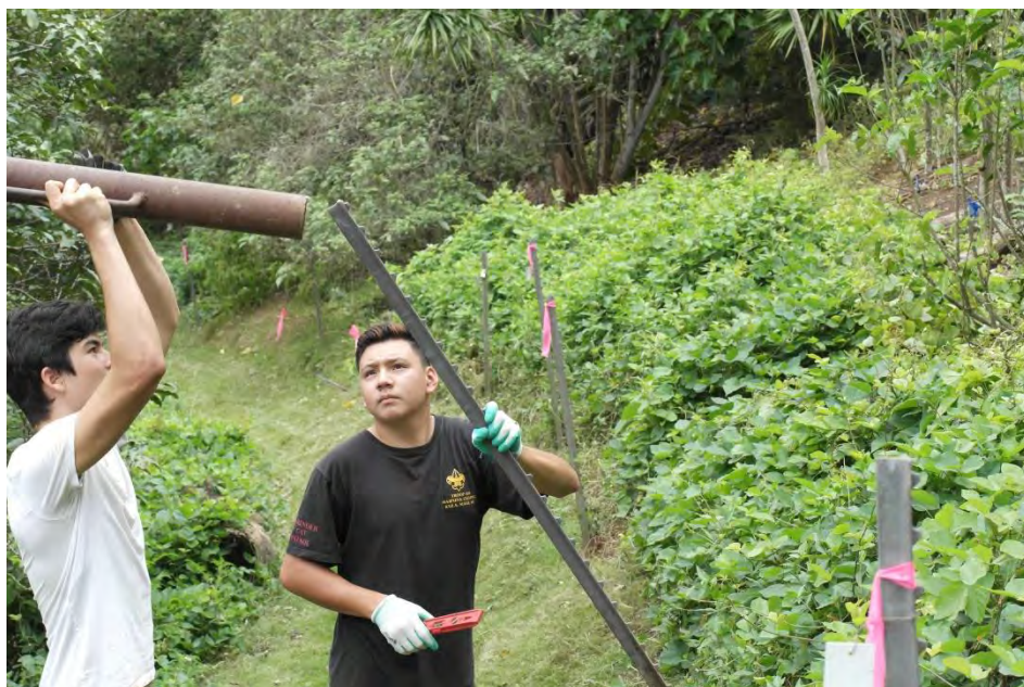
Pounding in stakes in teams straight and in line.