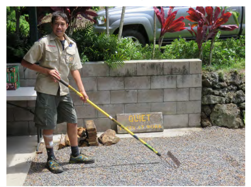
Detail clean up to perfection.