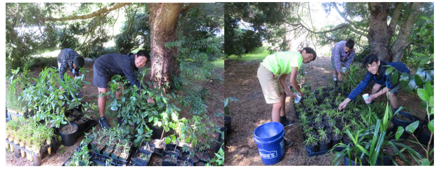
Fertilizing carefully all nursery with 140 day slow release high nitrogen plus trace elements.