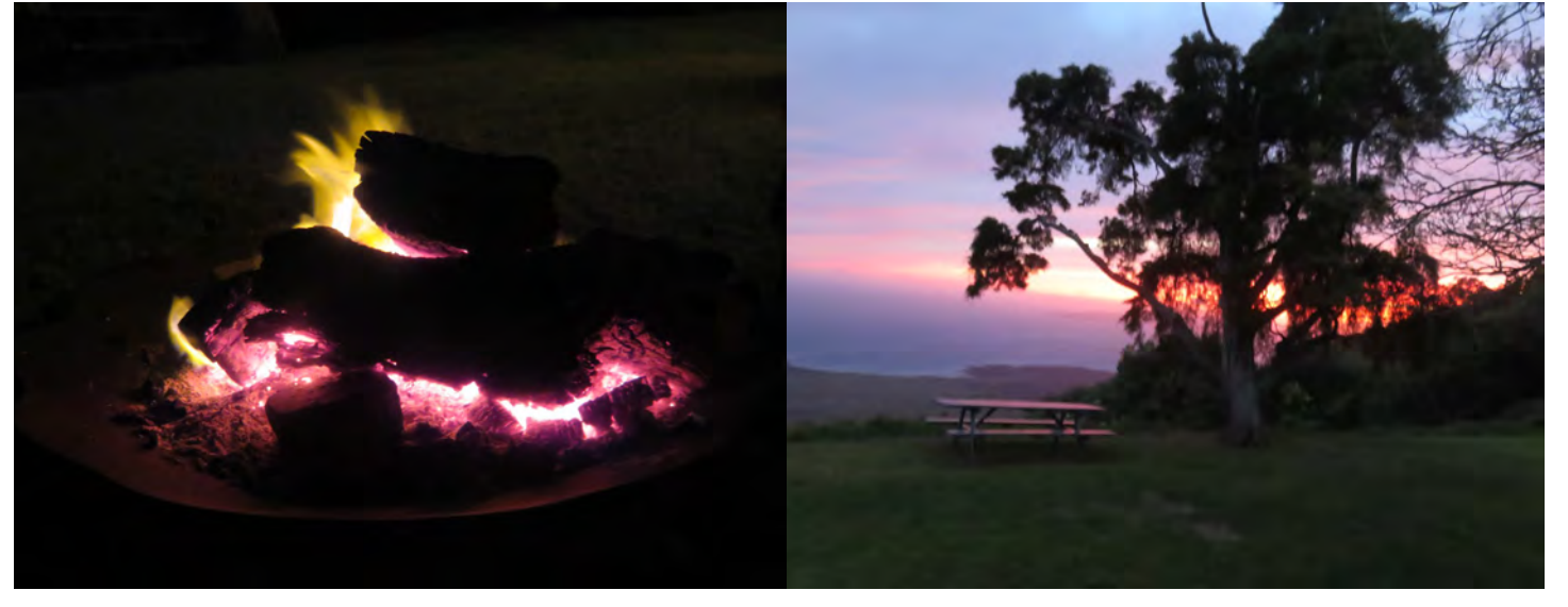
Campfires and perfect weather. Thank you Scouts for your "Citizenship in the Community" Award.